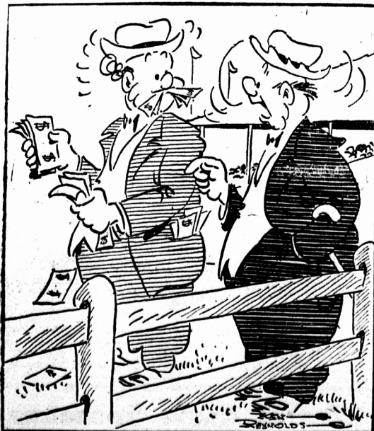
"Horses, or Guardian Want Ads?"