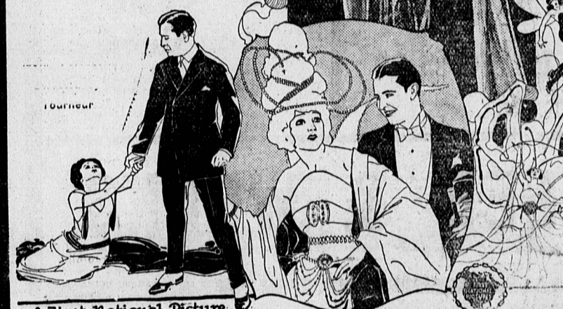
A First National Picture

Barbara La Marr AND Conway Tearle STAR MAURICE TOURNEUR produced it