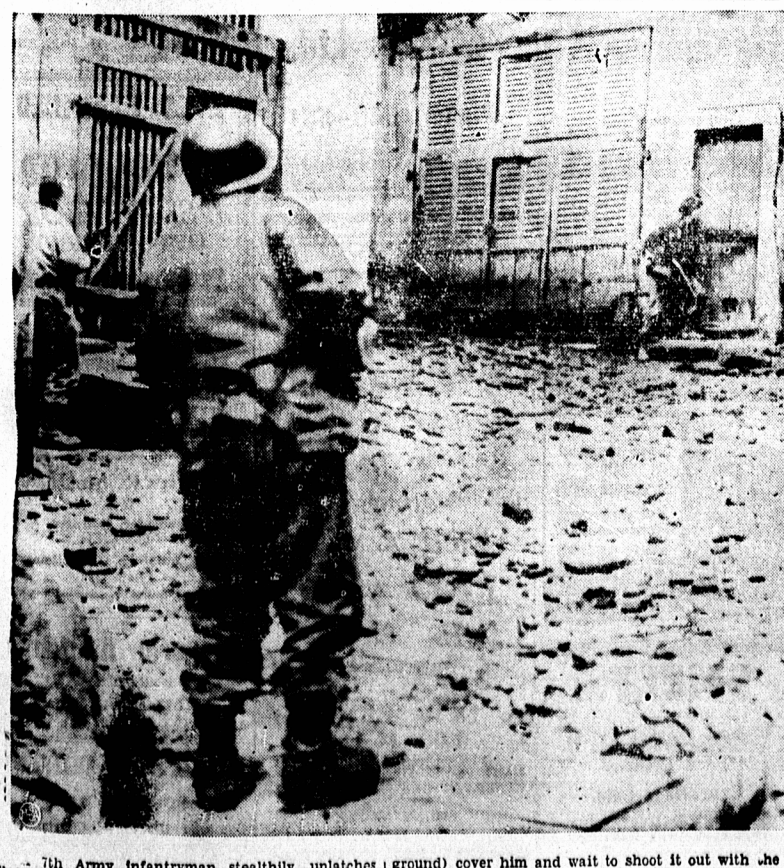
7th Army infantryman stealthily unlashes the door of a house in Niederbronn, France, which is beset with snipers, while two buddies (foreground) cover him and wait to shoot it out with the unseen foe.

Mr. MacKenzie King: May I suggest that there are really two questions involved in what the hon.