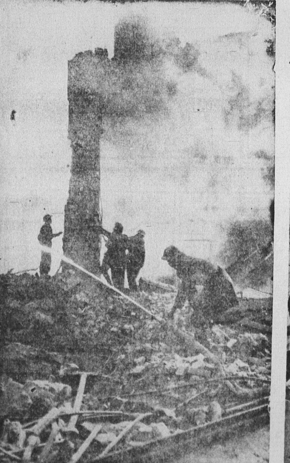
Danger every minute is the lot of the 18,000 rescue workers in the London area. On the job while bombs still fall, they carry on amid falling timbers and crashing masonry after the raid is over, digging into the debris to bring out trapped victims of the war on civilians. They work in 24-hour shifts, and one party burrowed for 48 hours without a halt to reach a nurse in the wreckage of a hospital.