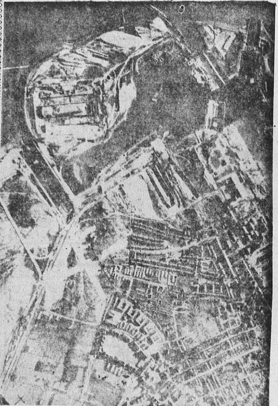
For the fortieth time this great Reich port and base silt under the sights of R.A.F. bomb-almers Jan. 15. It is the vital Wilhelmshaven, and a brilliant moon made every detail stand out clearly. Celebrating the "fortieth anniversary" of their first trip over, the fliers made it the heaviest raid yet, started fires which raged so brightly that other bombers following could so easily find their targets. Returning home the raiders reported it will be "some time" before Wilhelmshaven resumes war work.