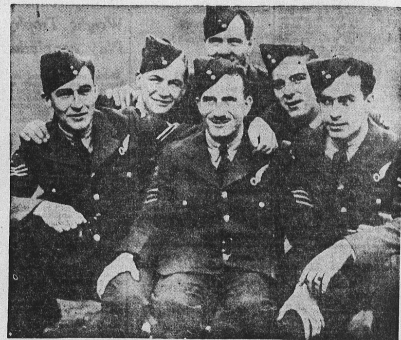
"In a few hours they looked just about as good as some of our men who have been flying for months. They have nerve and courage and have been given superfine instruction." This was the tribute of a British official to men among the first empire air training scheme fliers to reach England from Canada. Some, the officials said, ignored their five-day landing leave and insisted on getting right down to the job. In R.A.F. and R.C.A.F. squadrons, many have been raiding Germany and doing reconnaissance work. These Canadian sergeants, shown arriving in England, were trained here. Another batch of graduates of the empire air scheme arrived recently.