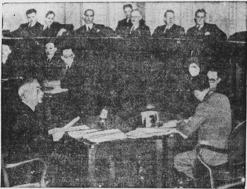
Declaring that "Germany could easily cross the Atlantic"—and will, if Britain fails, Secretary of State Hull strongly urged the House Foreign Affairs Committee to pass the administration's historic aid-to-Britain bill. He is pictured as he told the committee that such aid is "absolutely necessary for the defense of the United States."