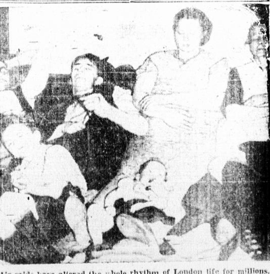
Air raids have altered the whole rhythm of London life for millions. Habits and customs of a lifetime have been changed in a fortnight to meet the daily timetable of the Luftwaffe. London has taken on many of the visible signs of a besieged garrison, with the people adjusting themselves to life among bombs just as the men, women and children muddled in the fortress of the Alcazar adapted themselves to siege by the Spanish Republican force. London's homeward rush-hour has been changed, from 6 p.m. to 5 p.m., to give the people a chance to get something to eat and set off for raid shelters with blankets under their arms before the sirens clear the streets for the nightly bombardment.

FACTS OF INTEREST Exports of Canadian newspaper in July were valued at $15,221,529 compared with $8,386,411 in the same month a year ago.