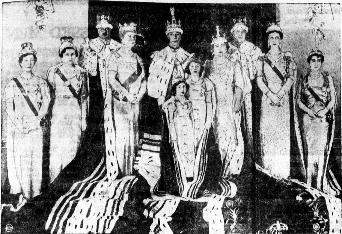
This is the picture that can be made only in a generation—the official coronation. Shown left to right are: The Princess Royal, Duchess and Duke of Gloucester, Queen Mary, King George VI, Queen Elizabeth, Duke and Duchess of Kent, Queen Maid of Norway, in front are Princesses