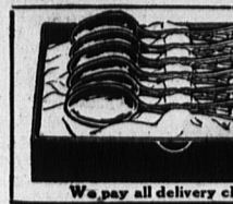
We pay all delivery charges on these Grand Premiums

YOU can secure without a penny of cost this magnificent, complete 97-piece English Dinner Service and a lovely set of half-dozen Wm. A. Rogers teaspoons. Each dinner service is guaranteed full size for family use, its 97 pieces consist of 12 tea plates, 12 dinner plates, 12 bread and butter plates, 12 soup plates, 12 sauce dishes, 2 platters, 2 oval covered serving dishes, 12 covered sugar bowls, a gravy boat, pickle dish, and a salad bowl. It is handsomely decorated in rich floral design and the beautiful set of Teaspoons are in the famous Wm. A. Rogers French Carnation design, with highly polished bowls.