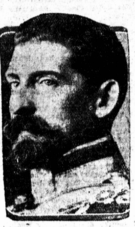
King Ferdinand of Rumania, rumors of whose abdication have been categorically denied in official Bucharest circles. An official of the foreign office declared the rumors were the "wildest fantasy possible."

A committee of elected Conservatives representing every province will decide at some future date when and where the national convention will be held next year.