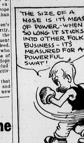
THE SIZE OF A NOSE IS ITS MEASURE OF POWER—WHEN IT'S SO LONG IT STICKS INTO OTHER FOLKS BUSINESS—IT'S MEASURED FOR A POWERFUL SWAT!