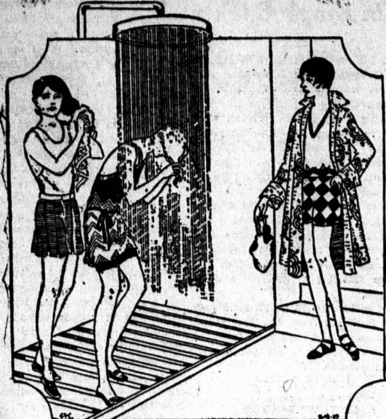
The hair should be rinsed well in fresh water