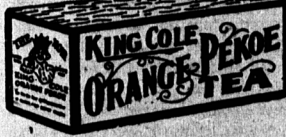
You will enjoy King Cole Coffee too

KING Cole Orange Pekoe Tea costs more by the pound, but less by the cup. It is blended entirely from "small leaves." These are the tender young shoots and bud leaves of the tea plant.