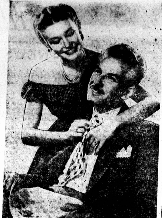
Round of chores may give father the idea his lot is all work. Sunday, June 15, is Father's Day, when family members, like this solicitous daughter, correct that notion.