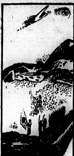
Salute to a doomed man