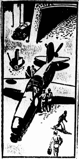
Nose is really a torpedo