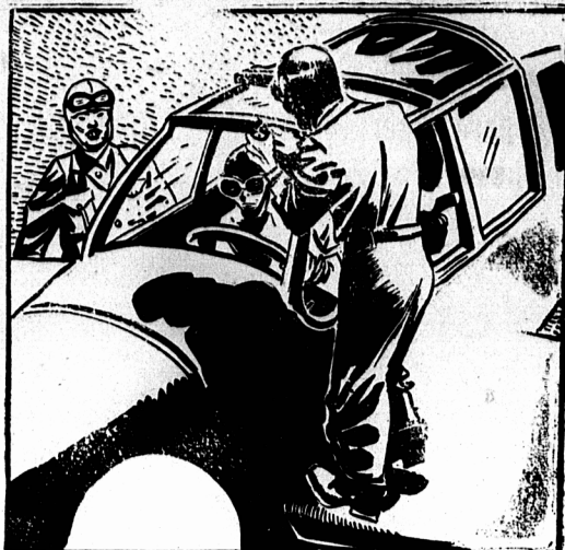
Helpless pilot is locked into cockpit from the outside