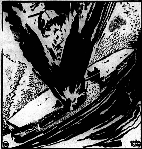
The goal—a crash dive into an Allied warship

Planes which actually are flying torpedoes, flown by "suicide" pilots and intended to be crashed against Allied battleships and carriers are reported to be in large scale production by the Japs in Manchuria.