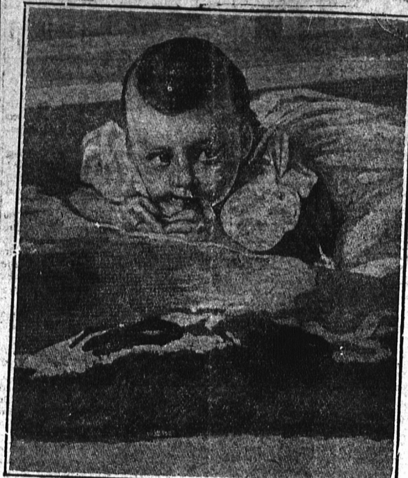
LATEST PORTRAIT OF THE KAISER'S GRANDSON.