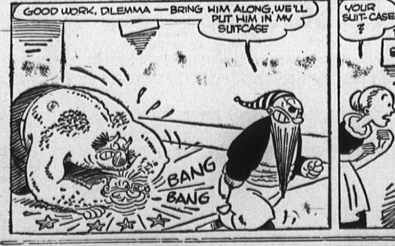
BRINGING UP FATHER