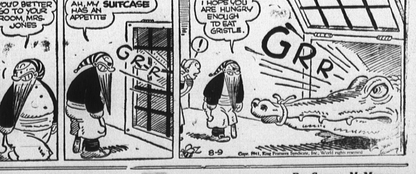
By George McManus