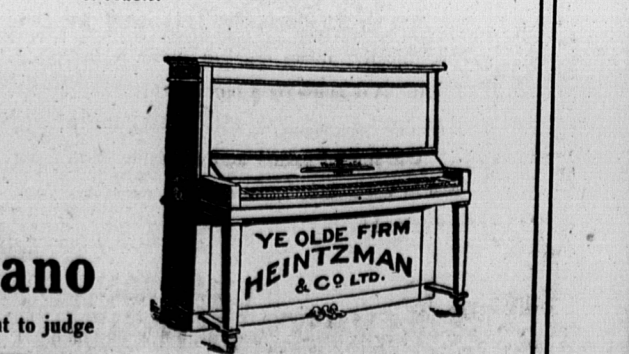
A Heintzman & Co. Upright Art Piano