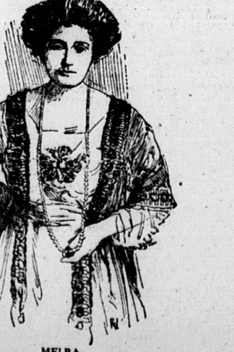
MELBA. one of the many great artists who have used a Heintzman & Co. Piano and enjoyed this wonderful instrument.

The Delightful Quality of the Heintzman & Co. Art Piano is recognized and appreciated best by those who are most competent to judge