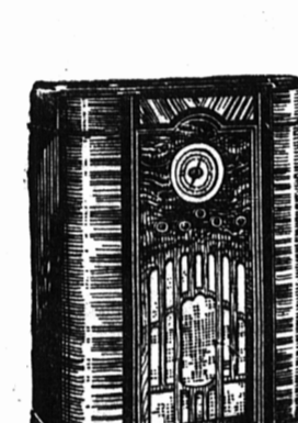
Victor "Globe Trotter" 224 (3-Band All-Wave) $125.00, with tubes