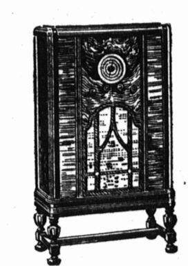
Victor "Globe Trotter" 211 (2-Band Selective Wave) $84.50

Table models $62.50 up | Consoles $84.50 up from