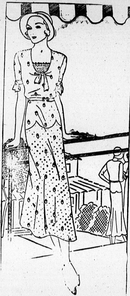
READY FOR ALL-DAY OCCASIONS

It's neither too dressy nor too sportive to meet everyday needs. It's truly versatile! Ever so youthful! It's a clever interpretation in flat crepe silk in brown and white print, so importantly high in the mode. A tiny vestee of eyelet mousseline in white adds such refreshing newness and chic femininity. The simple bodice is given a slight draped effect caught with a self-fabric knotted trimming piece at the center-front. Similar trim appears again on the short cuffed sleeves. Deep scallops give emphasis to the snugness through the hips of the comfortably full flaring skirt.