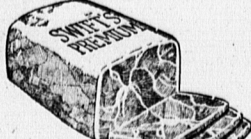
SWIFT'S PREMIUM COOKED HAM