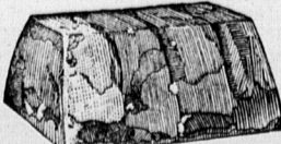
SWIFT'S JELLIED BEEF TONGUE

Select your summer menus from the choice variety of Swift Cooked Meats. Your nearest butcher or grocer has them.