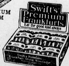
SWIFT'S PREMIUM FRANKFURTS