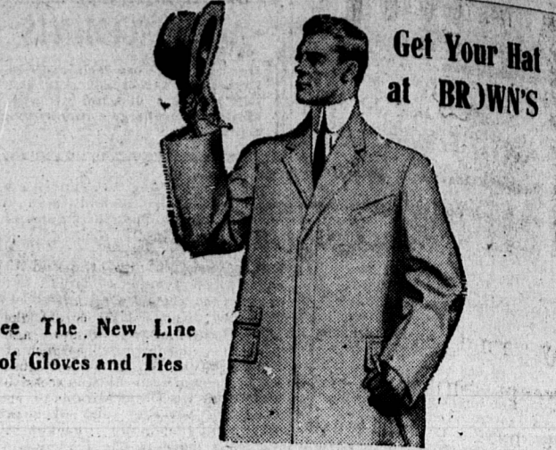
See The New Line of Gloves and Ties