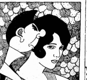
CARRIED BY TWO Wife: Why were you so late coming in last night? Were you held up by any one? Hubby: No, my dear, I was not held up by anyone—I was carried by two.