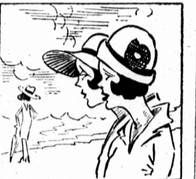
HEREDITARY, NO DOUBT Miss Lowbrow: I can't understand why she rushed into matrimony so soon.