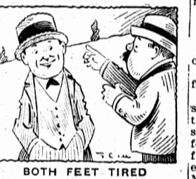
BOTH FEET TIRED "Gosh, but I skidded when I struck that spot!" "How could you skid?" "Both my feet were tired."