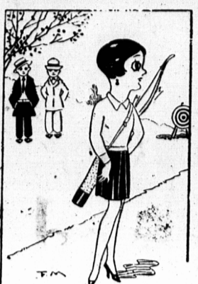
HER ARCH LOOK "She practices archery." "Ah, that explains her arch look."