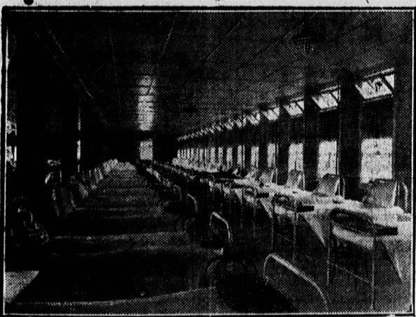
WARD IN CONVALESCENT HOME