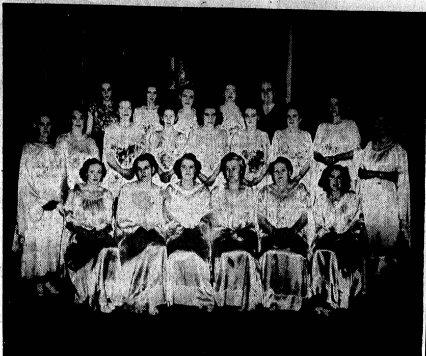
Shown above is the Degree Team of Alpha Rebekah Lodge No. 10, I.O.O.F., Charlottetown, P. E. Island.