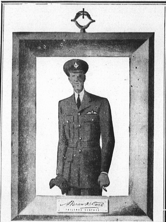
OFFICERS' UNIFORMS FOR THE THREE SERVICES.