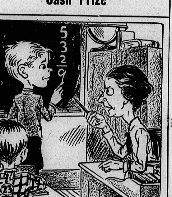
This is my answer to the above puzzle "FAMOUS CANADIAN" CONTEST.

Put Surname of Famous Canadian only. My subscription is paid in advance to Name of subscriber Address