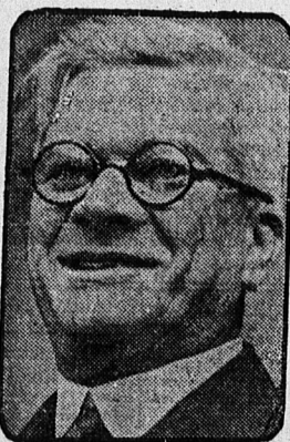
Gerardo Machado Exiled Cuban President whose life is in continued danger from revengeful Cubans.