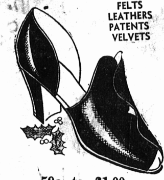
59c to $1.00

SLIPPERS FOR MOTHER—FATHER SISTER—BROTHER