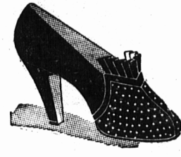
WINGS, PATENTS, BROWNS