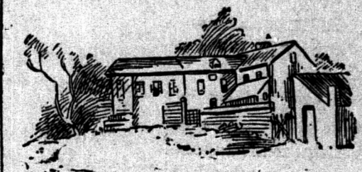
NAPOLEON'S RESIDENCE AT LONGWOOD, ISLAND OF ST. HELENA.

a coaling station. The garrison consists of a battery of Royal Artillery and one company of infantry. When Gen. Cronje's captured men are taken there with him its effect upon the diminishing population of the island may be salutary. The climate is all that could be desired and the longevity of those who remain there is great. It is not probable, though,