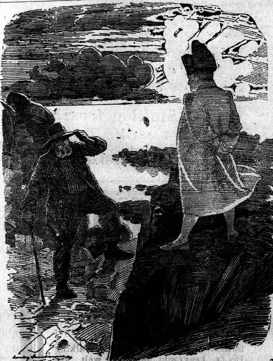
NAPOLEON AND CRONJE—The Fortunes of War.

NAPOLEON'S PALINDROME. Napoleon was guilty of a palindrome when at St. Helena. This has been one of the aids to keeping the island upon the maps. A palindrome is a line that reads alike backward and forward. Napoleon was pacing under a lone tree of Longwood when he was approached by an Englishman, who asked him.