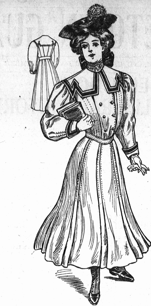
FOR THE SCHOOL GIRL.