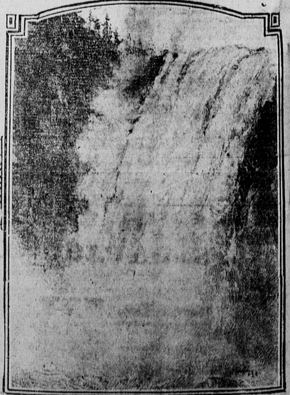
Grand Falls—one of the world's greatest cataracts. Brought into the public eye in the recent territorial Labrador award to Newfoundland against Canada, the waterpower of this rugged domain is regarded as one of the greatest plums known. Chief among the great power cataracts is the Grand Falls, one of the mightiest in the world. They were discovered in 1839, but have been seen by few white men. The falls have a vertical drop of 316 feet. The banks of the Grand river rise in towering cliffs. The illustration on the right, made from a rare engraving, shows the Grand Falls viewed from a projection of rock below facing is the canyon, a quarter of a mile below the falls. For some time after the privy council judgment there was doubt concerning the actual ownership of Grand Falls. The arrival of the text of the decision, however, removes this doubt and it is admitted that the judgment awarded the cataract to Newfoundland.