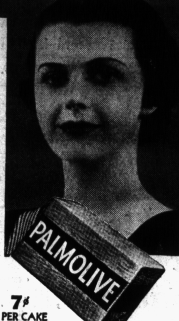
7 PER CAKE

Try this Quality soap today. Massage its gentle lather into the skin of face, throat and shoulders each night and morning. Do this for only a month and prove to yourself that the secret blend of palm and olive oils in Palmolive will make and keep your skin smooth as a baby's... clear, fresh, youthful. Lots of people use Palmolive in the bath, too.