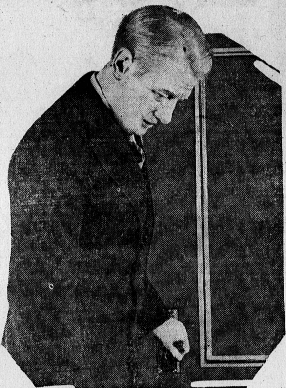
T. Q. Curtis staggered out of the room.

CHAPTER XLIII "Can you spare me a few moments in the library, Mr. Curtis?" Mrs. Meadows rose from the luncheon table one day in late May, with an air of purpose dominating her majestic, wrinkled old face.