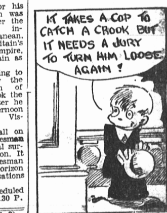
(Continued on page 3, Col 2)