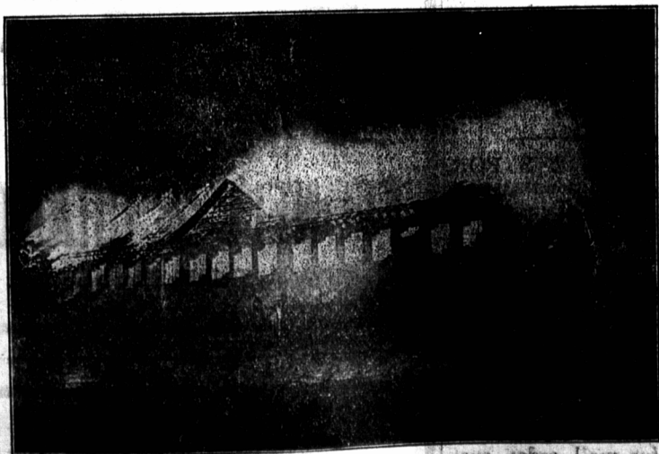
OLD MARKET HOUSE BURNING.