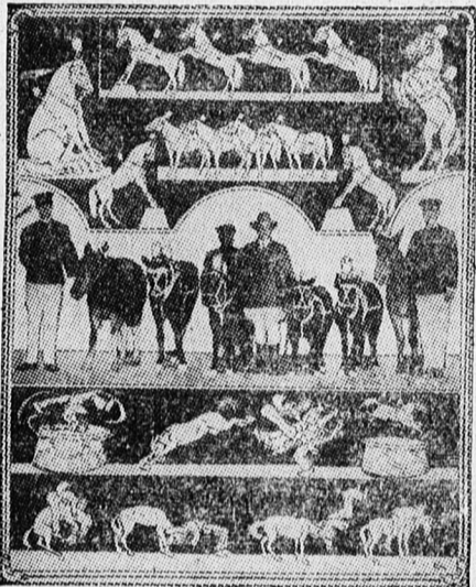
CARLOS COMEDY CIRCUS

Thrill-seekers will find plenty of action at the forthcoming Prince Edward Island Exhibition, when the Hustrei Family goes into action on a slender wire suspended at dizzy heights.