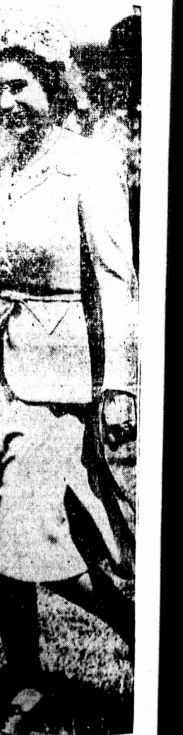
JUST A LITTLE BELOW THE KNEE

Ceramic tile, the freshest material extensively used as kitchen floor and wall covering gets its first test by fire during manufacturing when it is baked at 2200 degrees Fahrenheit.