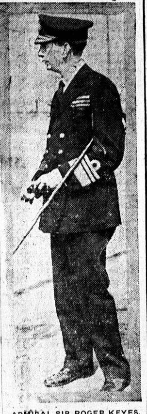
ADMIRAL SIR ROGER KEYES. In command of the British Mediterranean Fleet, who was injured when an airplane in which he was travelling was forced to land.

FIG NEWTONS 1-3 cup shortening 1-2 cup sugar 1 egg 1 cup All-Bran 2 cups flour 1-2 teaspoon salt 2 teaspoons baking powder 1-3 cup milk. Cream the shortening and sugar together and add the egg. Beat well. Add All-Bran and sift the flour, salt and baking powder, alternating this with the milk, until all the ingredients are used. Put in the ice box an "hour" or chill. When cold, roll in a thin strip, 4 inches wide. Fill one half lengthwise with fig filling. Fold other side over and pinch sides together. Cut this strip in pieces 2 inches long. Brush with milk and bake on buttered baking sheet. (350 to 375 degrees.)