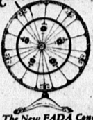
The New FADA Case Speaker in floor and table models

FADA RADIO reflects the united genius of the foremost radio engineers and radio scientists in the world today.