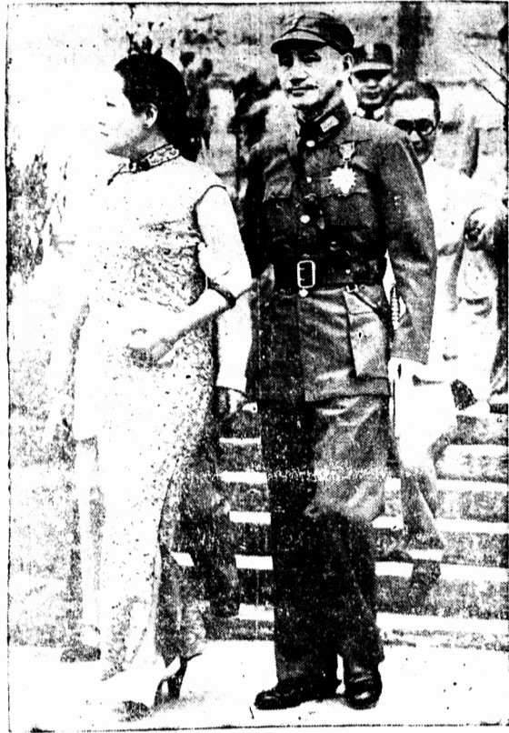
Proud spectators of United Nations review in Chungking were Generalissimo Chiang Kai-shek and Madame Kung, sister of Madame Chiang and daughter of the late Premier U. S. Army Air Force pilots and Chinese Boy Scouts were among the marchers in parade.