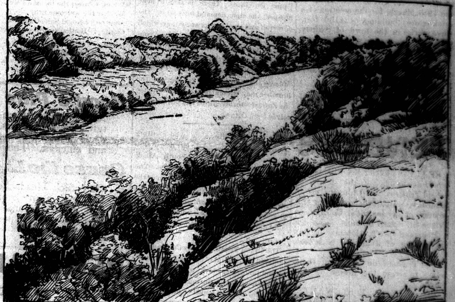
Invasion of the Orange State--The Modder River.