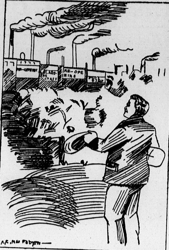
JACK CANUCK:—It is good to see factory smoke once more. Long live Bennett!