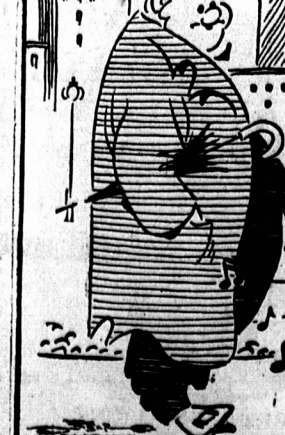
"This bird I got with a Guardian Want Ad whistles at every girl I see!"