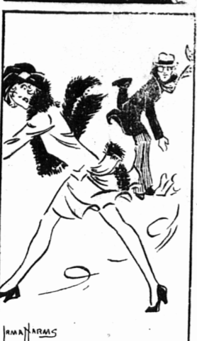
"A strong wind has driven many a man out to sea."