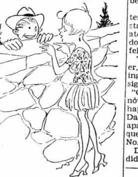
He: You should see our family tree. She: Bet it was a slippery elm.