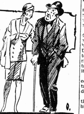
THE COUNTRY FAIRS "Didn't you see Joe at the fair this week?" "Oh yes! Joe always goes when ever I exhibit myself."