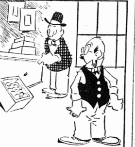
CONTAINED NO CHICKS Unobsvant Customer: I suppose you guarantee there's no chickens in these eggs?