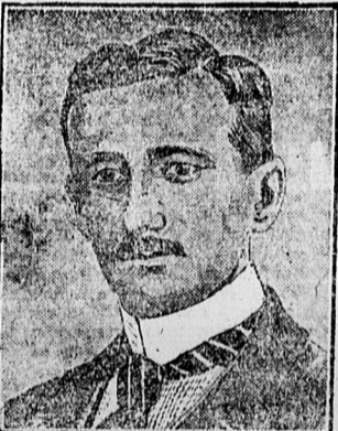
SIGNOR MARCONI. MARITIME PROVINCIAL SECURITIES.