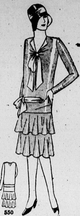
TIERS ARE CHIC

Perhaps you have hesitated to make a tiered frock because you have thought it would be so difficult. I'm going to show you how simple it will be to make Style No. 550 with flattering sunburst neckline. It is one-piece! Close side and shoulder seams. The tiers are stitched to dress following perforated lines provided for same. The belt slips through bound openings and ties in bow at side. The dress is cut from neck at centre-front and underlaced and rolled to form the revers. It is designed in sizes 16, 18, 20 years, 36, 38, 40 and 42 inches bust. It is sketched in honey-beige silk crepe, a smart choice for general summer daytime occasions, because it can be worn in town or for beach. Printed silk crepe, georgette crepe, flowered chiffon, printed voile, rajah silk and handkerchief linen offer lovely ideas for its development. Pattern price 15 cents in stamps or coin (coin is preferred). Wrap coin carefully.