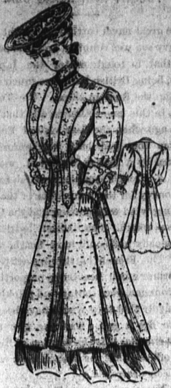
SMART REDINGOTE WRAP.

In all Lines of Stylish and Serviceable Vehicles—A. Horne & Co. Have an Unexcelled Assortment.