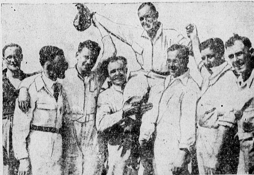
Sir Malcolm Campbell is seen in the shoulders of his mechanics the above picture being lifted bodily after breaking his former world's record out of the car and carried on auto speed record by over 20 miles an hour to become the first man to have travelled at over 273 miles an hour on land.