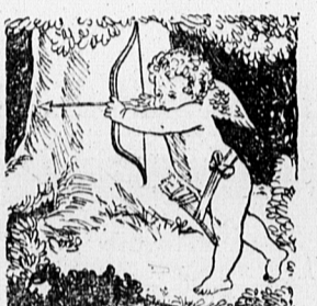
Cupid arrows are famed in song and block.

Why should the 14th of February be chosen as the date for Valentine's day? The reason is not certain but it may be due to an old English legend that birds chose their mates for the springtime on this date.