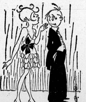
She: I shall insist that you tell me you are sorry you stole that kiss. He: You'd be justified in slapping my face if I did.