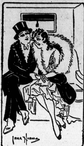
"Many a man with a charming wife takes her out because her husband wouldn't."