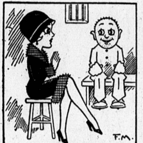
WHEN HE DID Lady Visitor: And when does your term expire, my good man? Life Prisoner (dryly): When I do, ma'am.