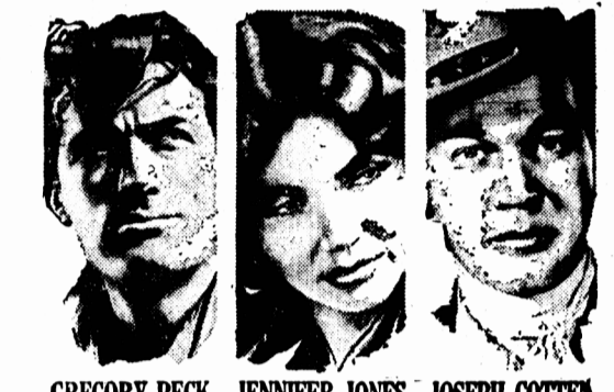
GREGORY PECK, JENNIFER JONES, JOSEPH COTTEN

DAVID O. SELZNICK'S 'DUEL in the SUN' in Technicolor