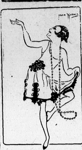
"The girl who never would mention her bows, now allows them to speak for themselves."