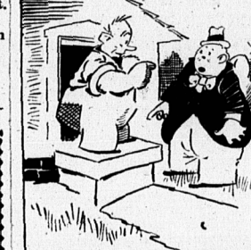
FARMER TO HIKER: I told you about an hour ago that Cobbs' Corners was two miles east—as the crow flies. City feller: I followed one of those blamed crows and he came right back here!