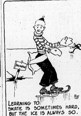
LEARNING TO SKATE IS SOMETIMES HARD, BUT THE ICE IS ALWAYS SO.