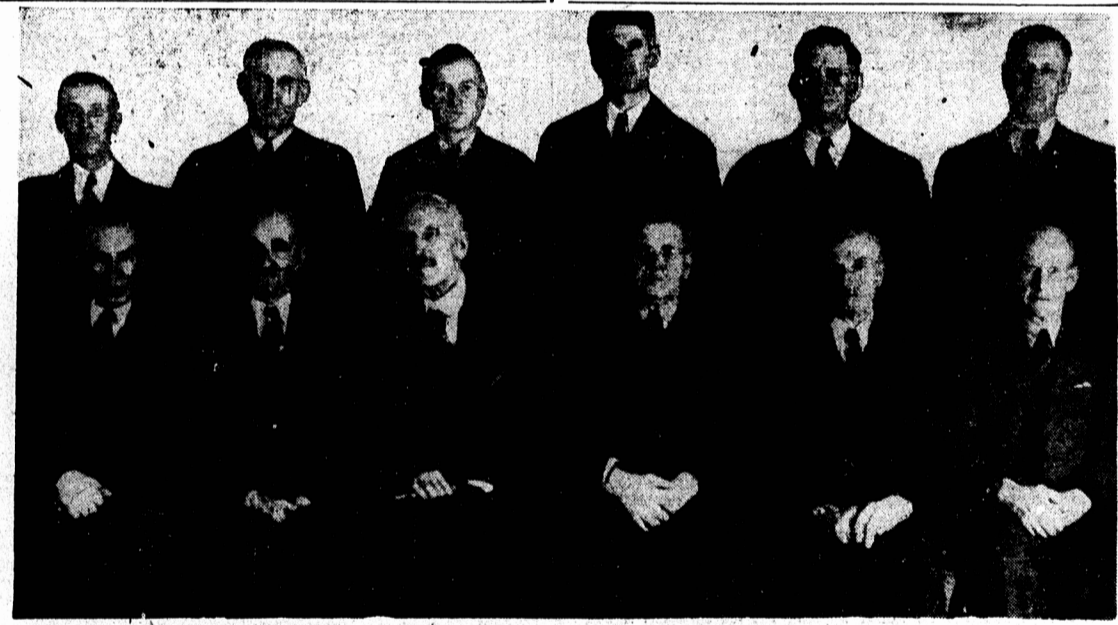
MEMBERS OF SESSION; BEDEQUE PASTORAL CHARGE, THE UNITED CHURCH OF CANADA, 1948