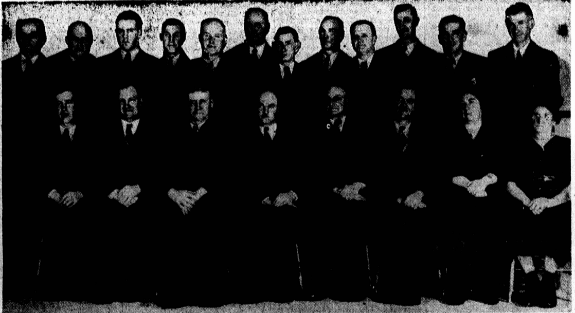
STEWARDS AND TRUSTEES OF BEDEQUE PASTORAL CHARGE, THE UNITED CHURCH OF CANADA, 1948.